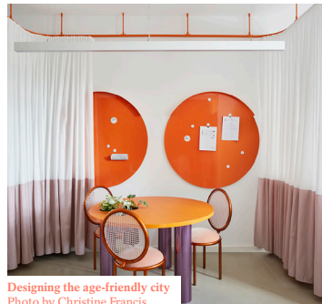
Designing the age-friendly city

Designing the age-friendly city: Panel discussion led by HARI (Hallmark Ageing Research Institute) Wed 8 Nov, 6–7.30pm