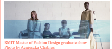
RMIT Master of Fashion Design graduate show

A stage for new parenthood Tue 14 Nov, 12–3pm ☺