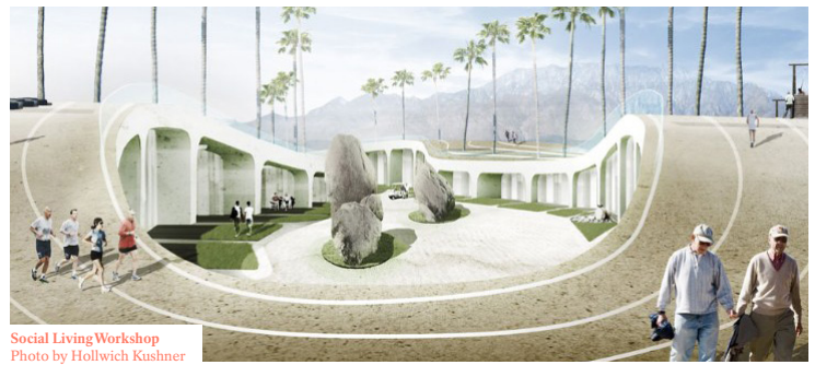
Social Living Workshop

Is good design measurable? Wed 29 Nov, 6–7pm